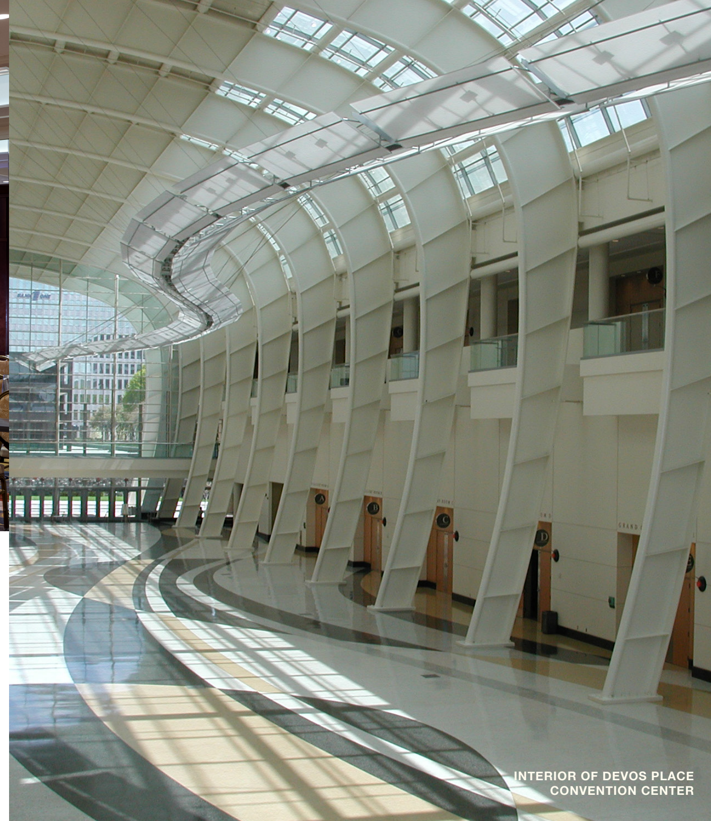
INTERIOR OF DEVOS PLACE CONVENTION CENTER