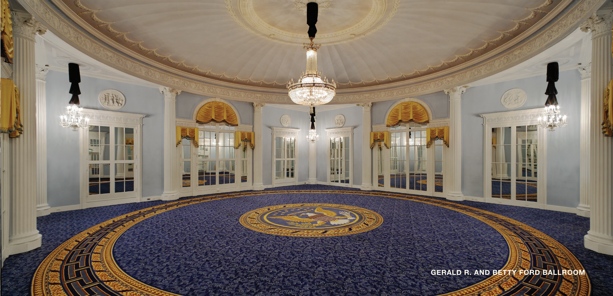
GERALD R. AND BETTY FORD BALLROOM