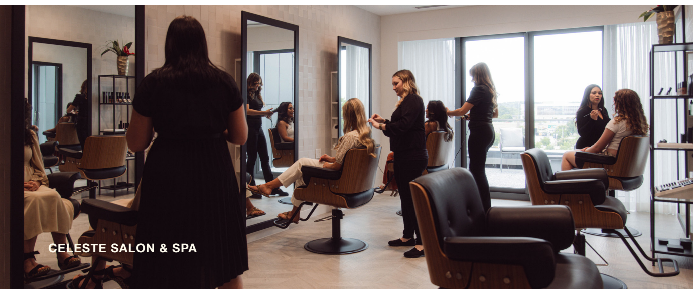
CELESTE SALON & SPA