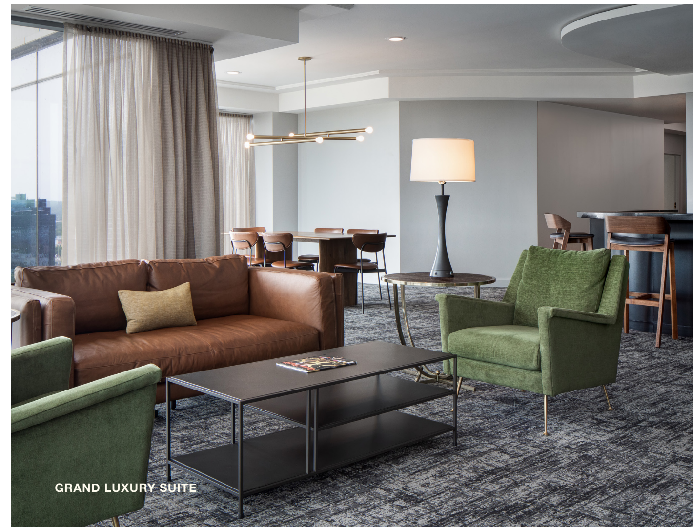
GRAND LUXURY SUITE