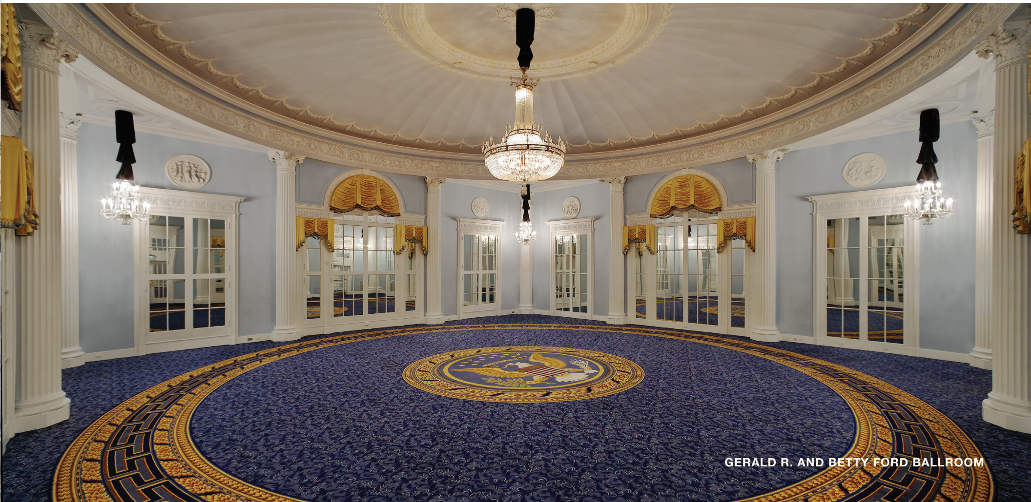
GERALD R. AND BETTY FORD BALLROOM