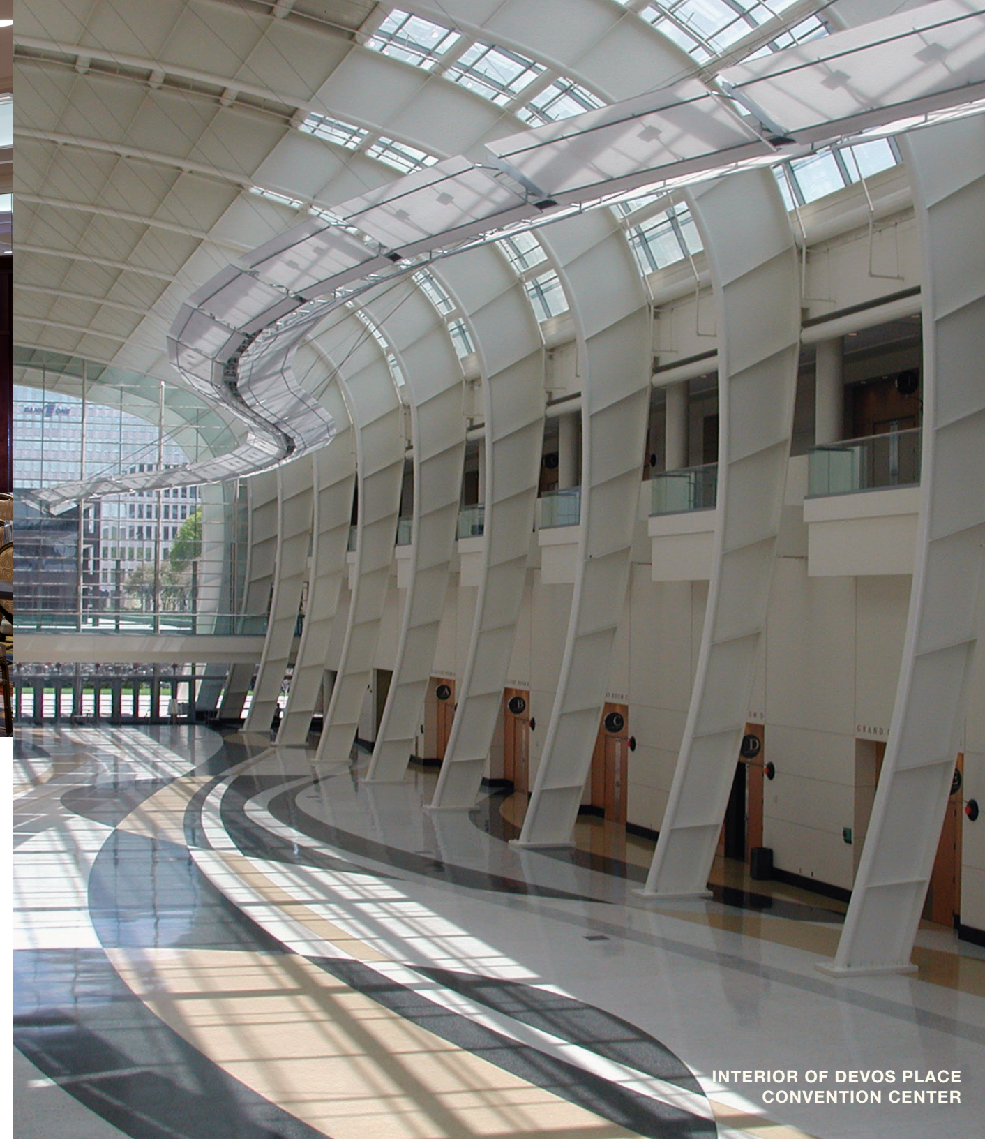
INTERIOR OF DEVOS PLACE CONVENTION CENTER